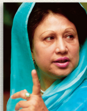
Chandrika Bandaranaike Kumaratunga